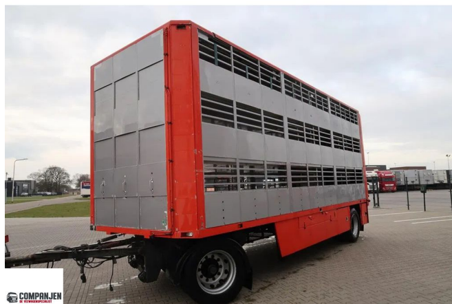
CUPPERS LVA 10 10 - 3 floors - pigs transport