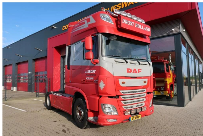
DAF XF 510 XF 510