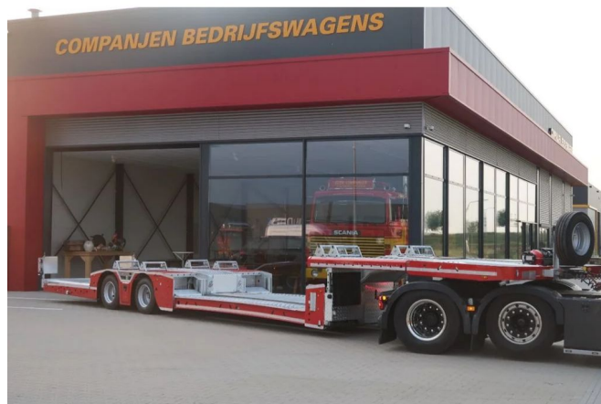
Diversen Eroglu TRR-TC-02