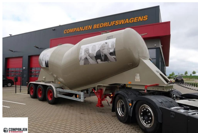
Diversen Filliat XTR32E2 - 1986 - Oldtimer - bulk cement trailer