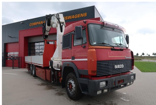
Iveco Turbostar 190.36 190-36