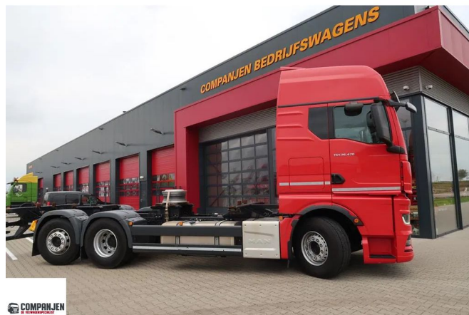
MAN TGX TGX 26.470 - BDF - Retarder - 2021- Steering axle 6x2