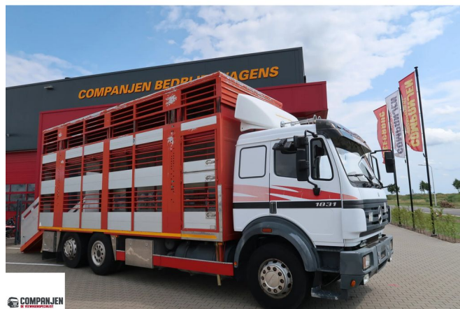
Mercedes-Benz SK 1831 SK 1831