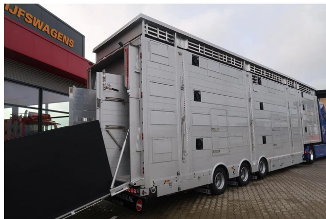
Pezzaioli SBA 31