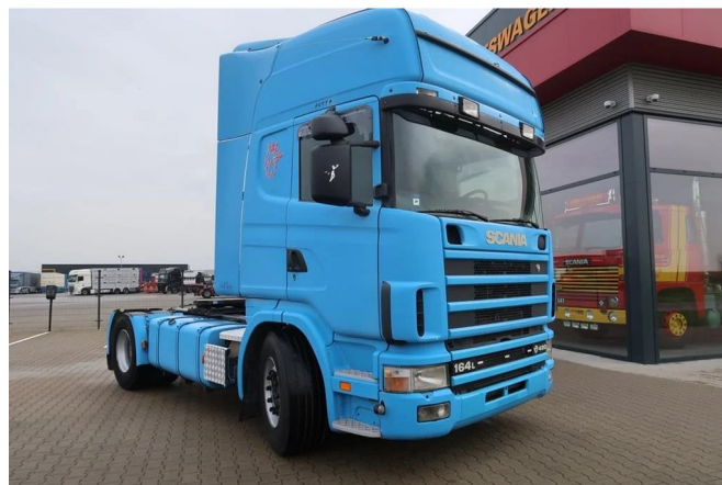
Scania R164-480 164-480