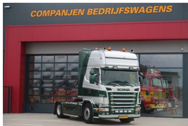
Scania R164-480 V8 164 480 Original Dutch Truck KING OF THE ROAD 4x2