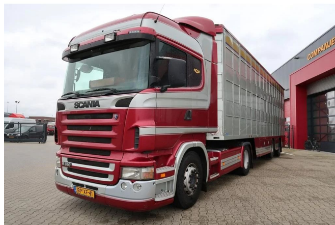
Scania R380 Highline