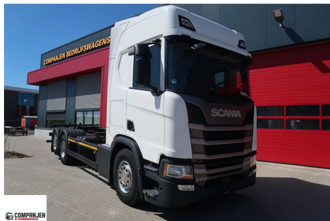
Scania R450 R450