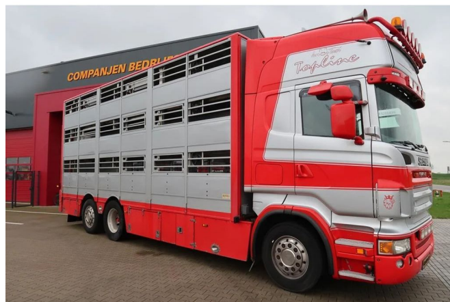
Scania R480 R480