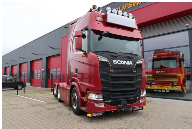
Scania S580 V8