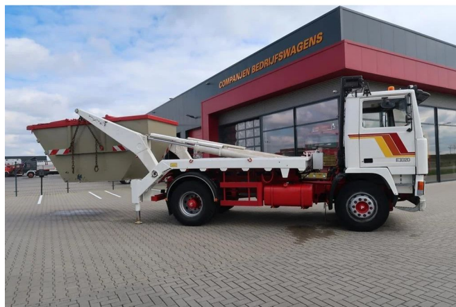
Volvo F 10 F10 4x2