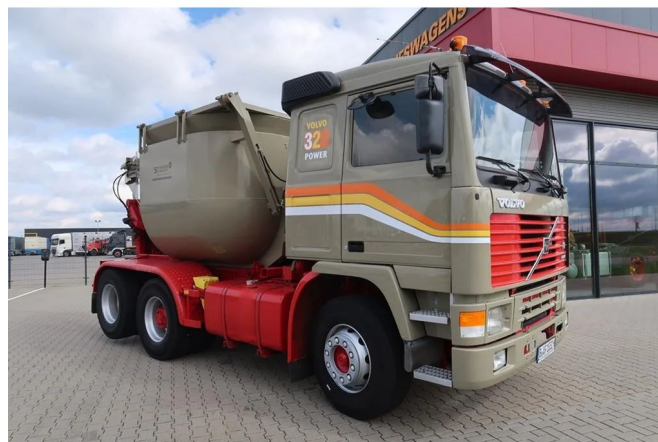
Volvo F 10.320 F10