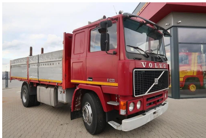
Volvo F 12 F 12-20