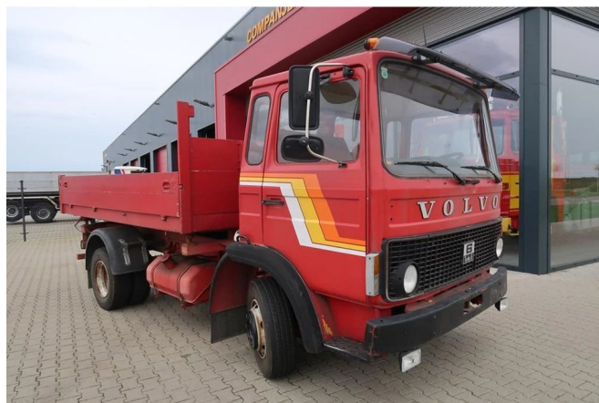
Volvo F 6 F 609