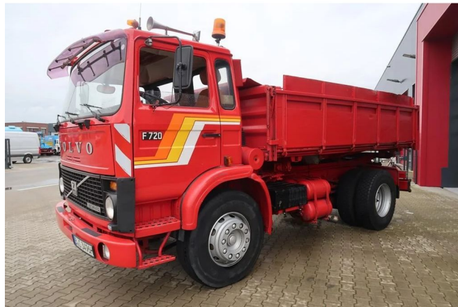
Volvo F 7 F 720