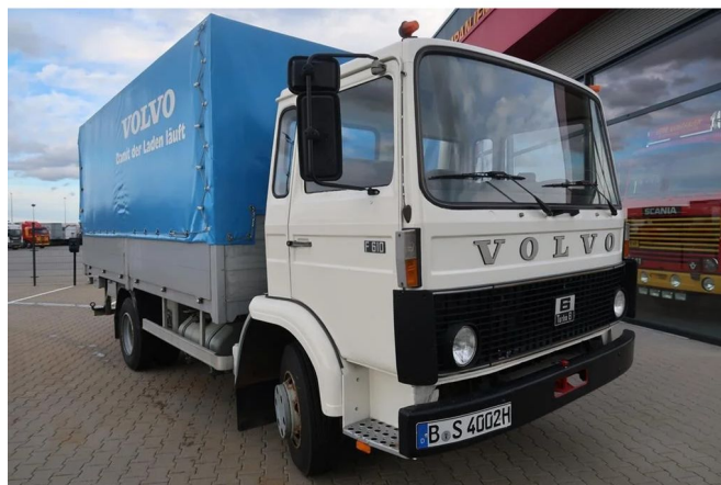
Volvo F F6-10