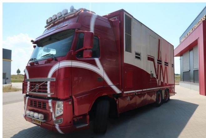
Volvo FH 13.500 fh 500 EEV

• 2 Floors • Aggregate • Air conditioning • Air horn • Air suspension • Air suspension all around • Aluminium fuel tank • Anti-lock braking system • Anti-lock braking system • Central locking • Coupling • Cruise control • Disc brakes • Drinking water installation • EBS • Electrically adjustable door mirrors • Electrically operated windows • Elevating loading platform • Fans • Fog lights • Heavy duty engine brake • Hydraulic floors • isolated roof • Liftaxle • lifting roof • Low-noise • Radio/CD player • Refrigerator • Remote central locking • Reversing camera • Roof spoiler • Side door • Sleeper cab • Speed limiter • Spoilers • Spotlights • Stability control • Storage space • Toolbox • Twin fuel tank • Vehicle heater • Visor • Xenon lighting