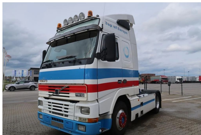
Volvo FH 16.520 FH 16