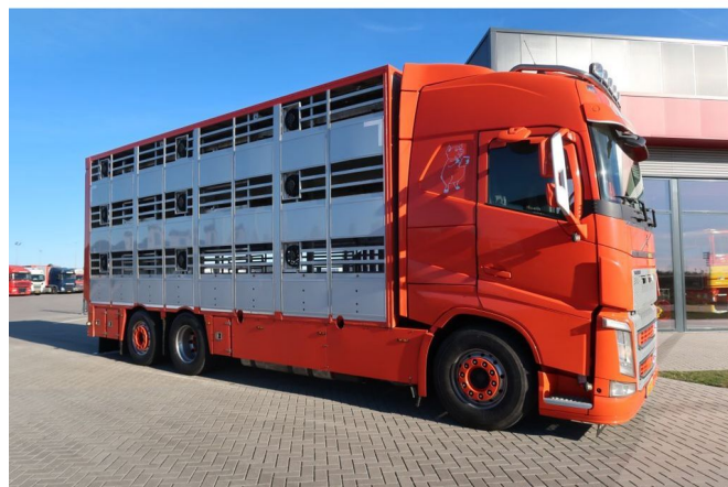
Volvo FH FH 460

• 3 Floors • Acc • Aggregate • Air conditioning • Air horn • Air suspension • Air suspension all around • Alloy wheels • Aluminium fuel tank • Anti-lock braking system • Anti-lock braking system • Central locking • Coupling • Cruise control • Disc brakes • Electrically adjustable door mirrors • Electrically operated windows • Elevating loading platform • Fans • Fog lights • Heavy duty engine brake • Led lighting • Liftaxle • Line detection • Low-noise • Navigation system • Particulate filter • Radio/CD player • Refrigerator • Roof spoiler • Shields • Sleeper cab • Speed limiter • Spoilers • Spotlights • Stability control • Storage space • Toolbox • Vehicle heater • Visor • Xenon lighting