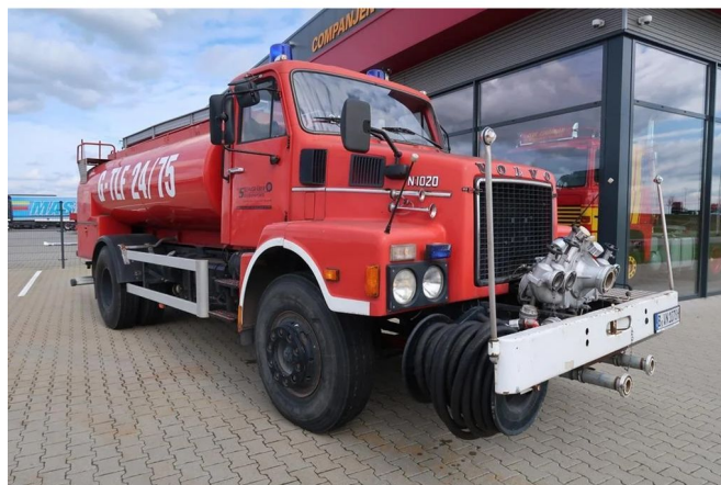
Volvo N 10 N10 4x2