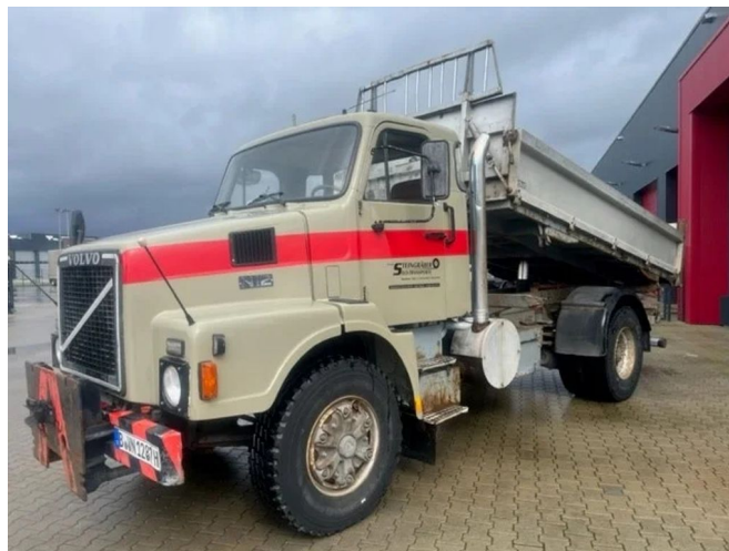
Volvo N 12 N12