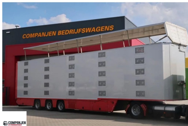
CUPPERS LVO 12-27 AL - 2014 - 5 LEVELS - Folding floors

???? ?????? ?????????????? 08-05-2014 ?????????? ??? OS-20-YJ ??? 10.900 kg ?????????????????? 28.100 kg ?????? ?????? 39.000 kg ?????????? ??? 910 ?????? 1.393 cm ??????? 260 cm