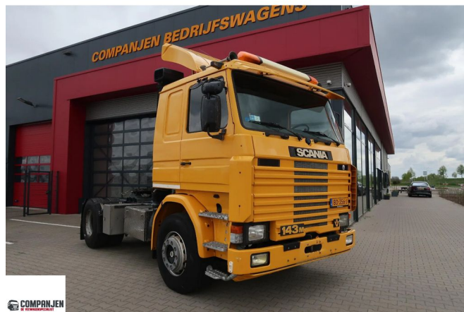
Scania R 143 MA 4X2 143 M