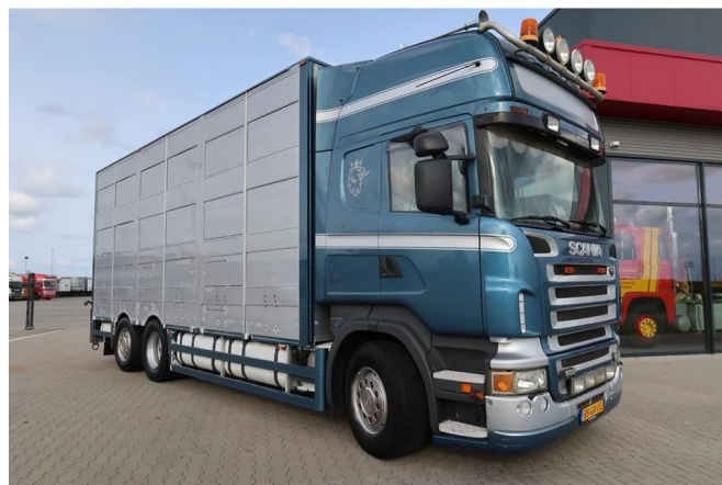
Scania R500 V8 R500LB6X2*4MLA